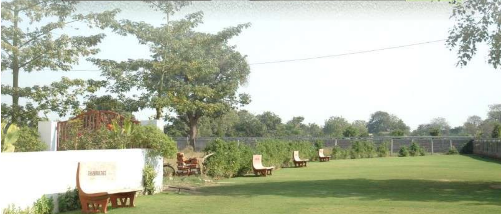
DEVELOPED COMMON PLOT